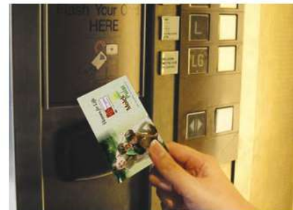
Tier 3: Lift access to specific levels via smart card reader.