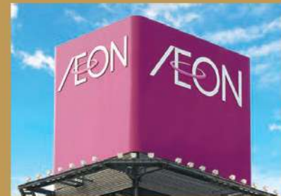
AEON Tebrau City