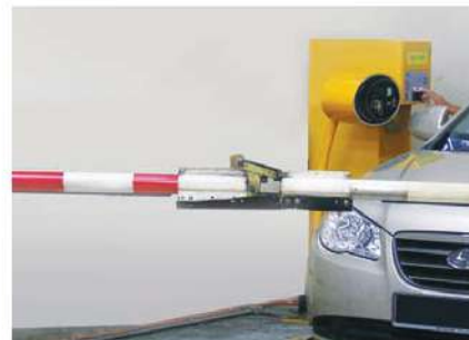
Tier 1: Sensor Access System at the barrier gates of the car park entrance.