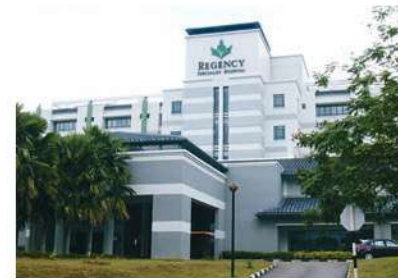
Regency Specialist Hospital