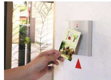
Tier 2: Security Access Card to the lift lobby via car park, and CCTV monitoring system for all entrances, exits and lift lobbies.